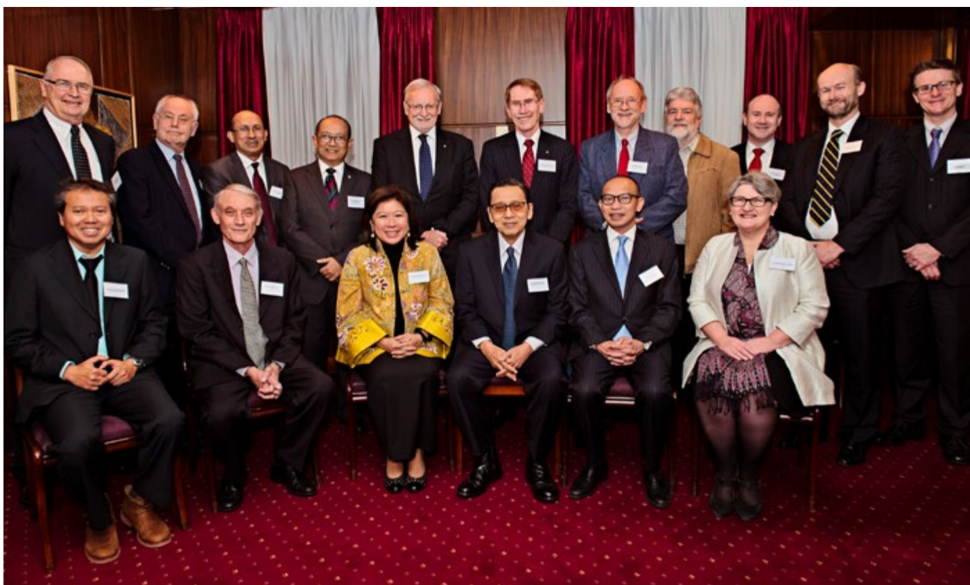
ANU Indonesia Project 50th Anniversary Celebration, July 2015.